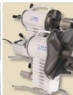
Available with compressed air or electric drive