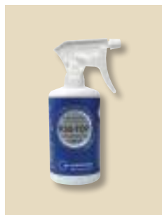
Cutting lubrication KSS-TOP included