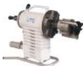
REB 6 Pneumatic

* It is possible to extend the dimensions by using the optional clamping wedges (accessories).