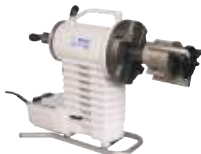
REB 6 Electric