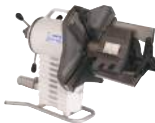
REB 14 Pneumatic