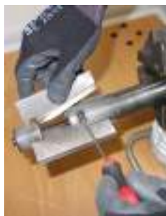
Fast adjustment of the pipe dimension