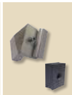
A wide range of tool holder and multifunctional tools (available option)