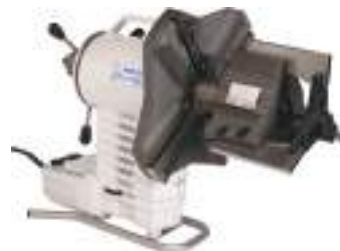
REB 14 Electric