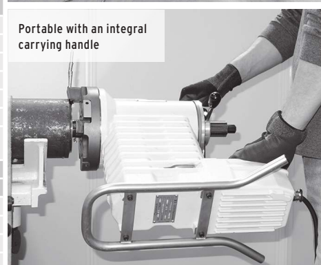
Portable with an integral carrying handle

The technical data are not binding. They are not warranted characteristics and are subject to change. Please consult our general conditions of supply.